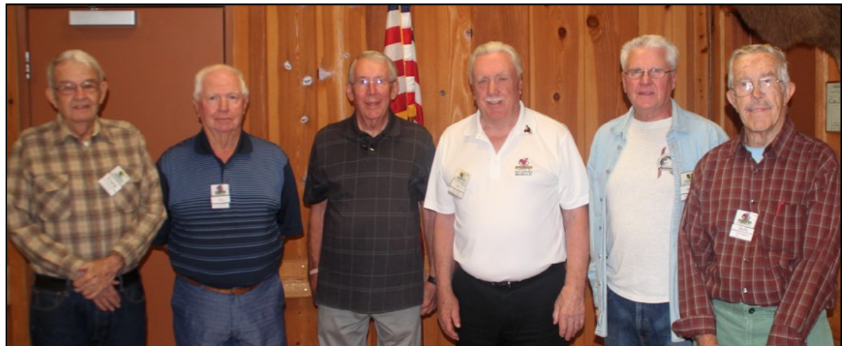
Sirs with birthdays in April who attended the Luncheon

ALL PHONE NUMBERS LISTED ARE IN AREA CODE 530 UNLESS OTHERWISE INDICATED