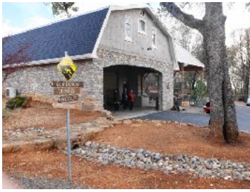
Wine Tasting at Besemer Cellars