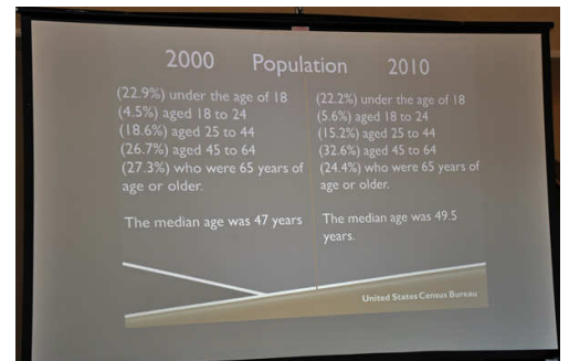
GUEST SPEAKER PRESENTATION